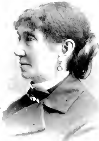
MARY JANE HOLMES.